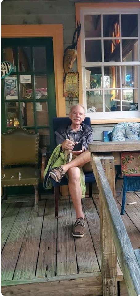
Key West 2020